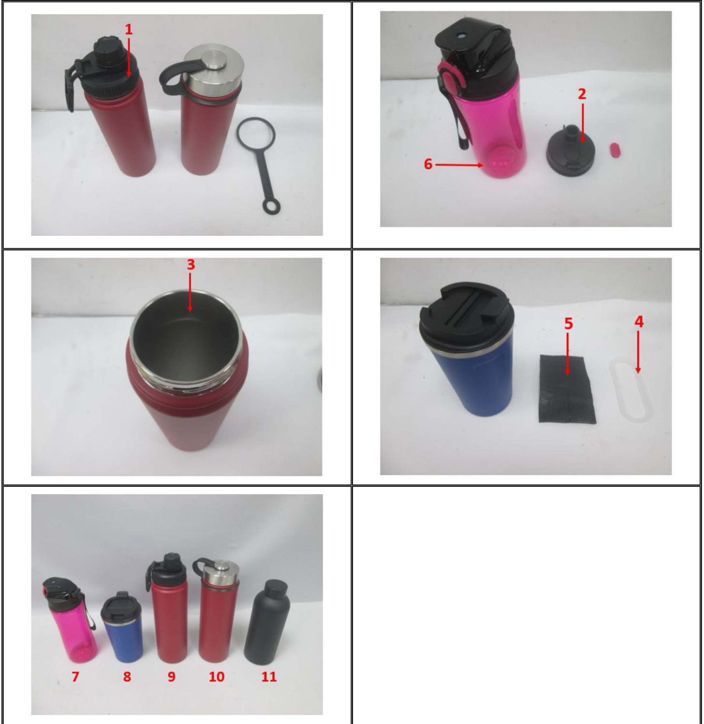
Photo of the Tested Sample