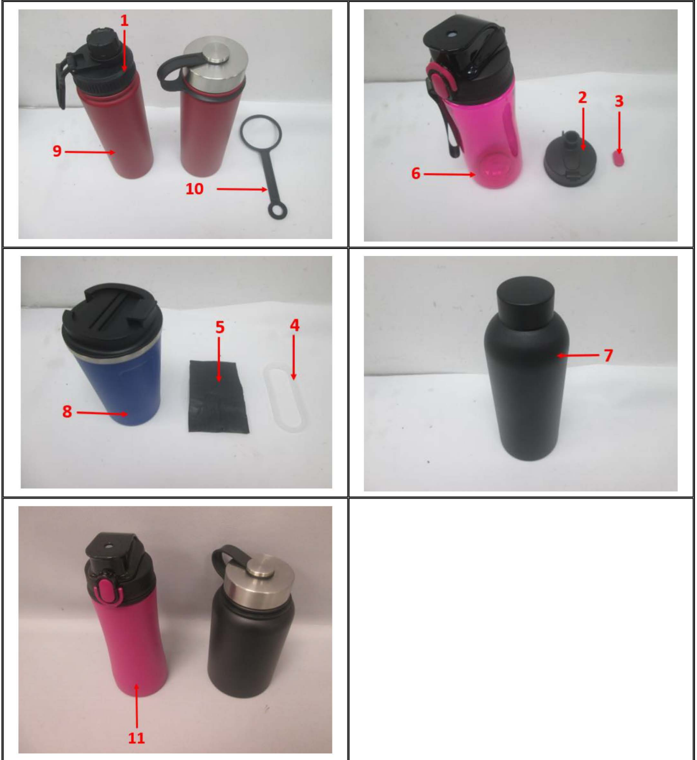
Photo of the Tested Sample