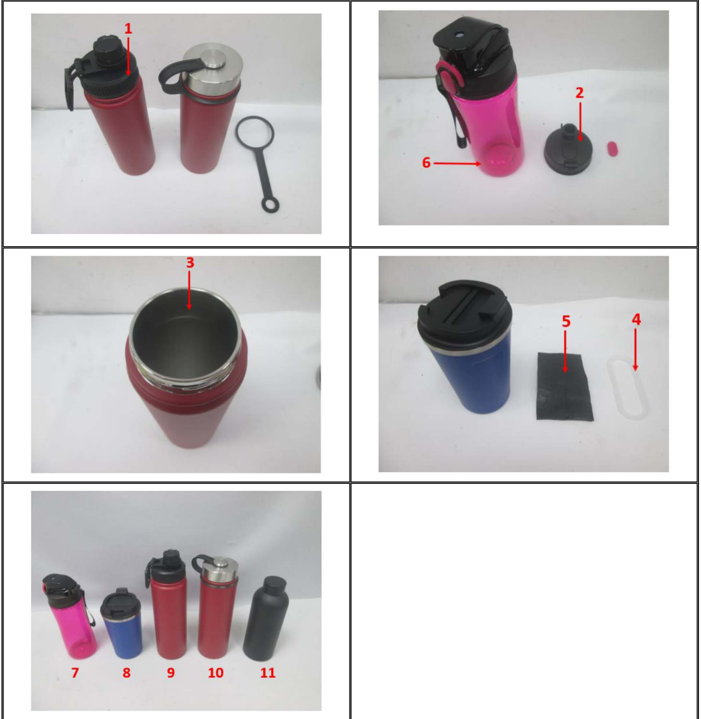
Photo of the Tested Sample