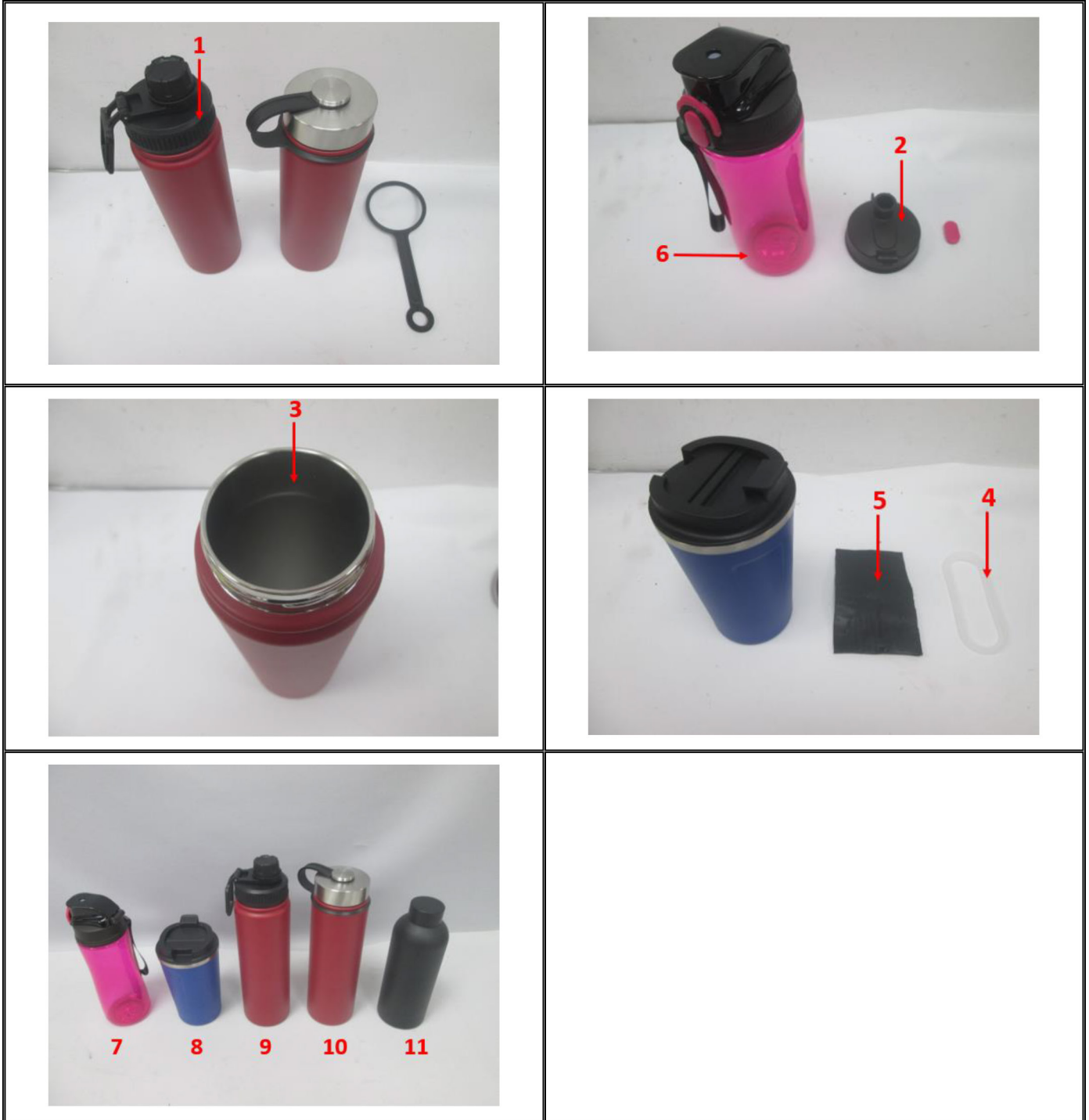
Photo of the Tested Sample