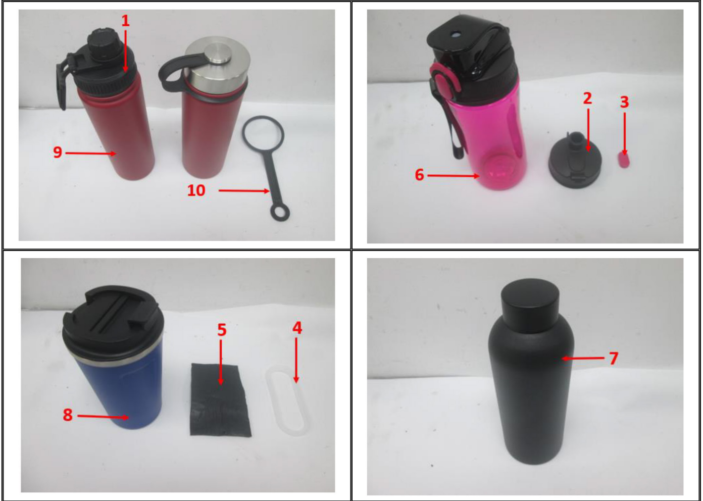
Photo of the Tested Sample

Technical Report : (6623) 289-1055 DATE : November 6, 2023 PAGE : 2 OF 3