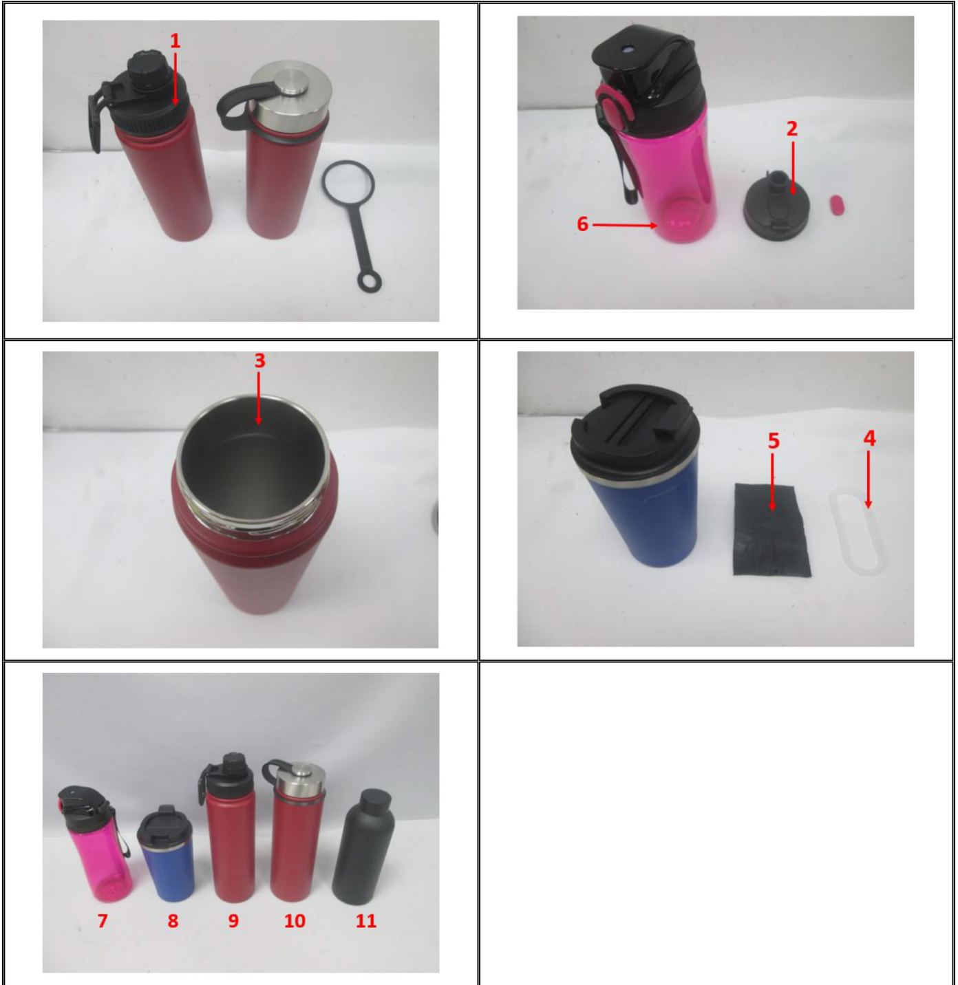
Photo of the Tested Sample